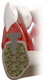
Fixed Hybrid Frame engages bone but teeth supported via acrylic gingiva only