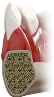
Traditional Denture No structural contact between occlusal surface and bone