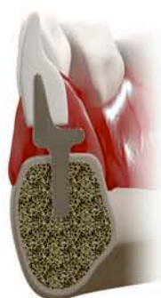
AccuFrame IC Direct transfer of occlusal loads to bone for optimal performance